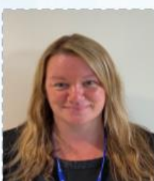
Miss Woods 1:1 Support